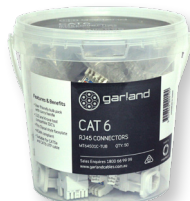
Tub - 50 Pack