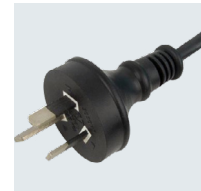
10A Standard Mains