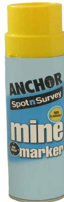
500ml /350gm Aerosol Carton Qty 12