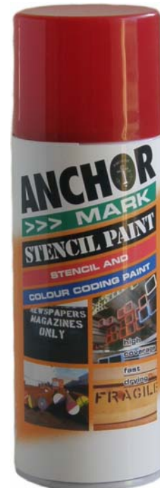
400ml / 300gm Aerosol Carton Qty 12