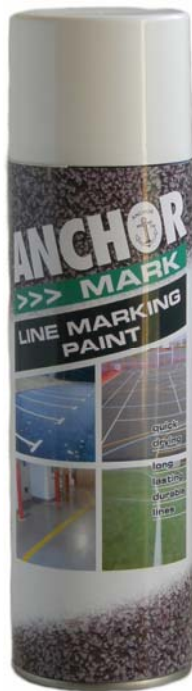
500ml / 480gm Aerosol Carton Qty 12