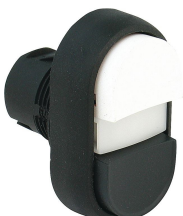
2-Function Momentary Multi-Operator Illuminated Cat. No. 800FP-LU2E2E1