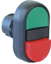
2-Function Momentary Multi-Operator Non-Illuminated Cat. No. 800FP-U2E4F3