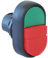
3-Function Momentary Multi-Operator Non-Illuminated