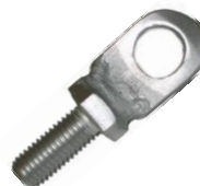
SLB – 2