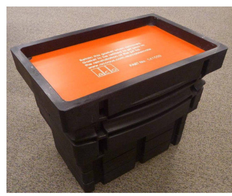
Typical gasket fitted in plastic pit