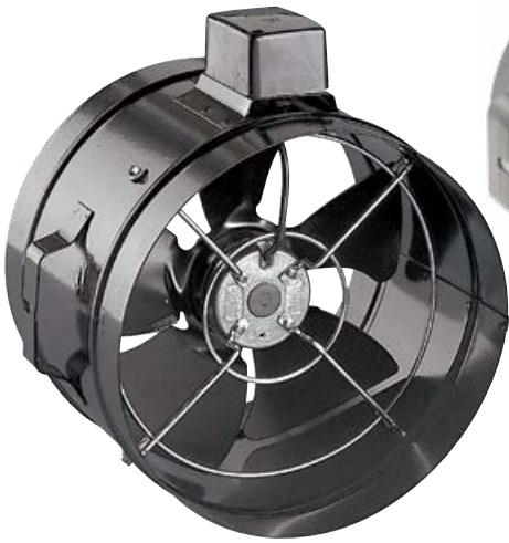
Metal construction model (MTS)