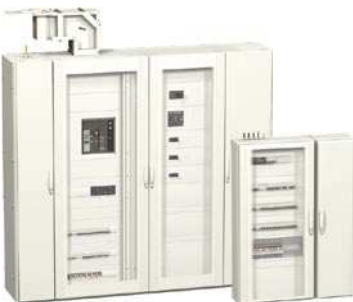
Prisma Plus cubicle