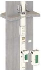
Canalis KS riser