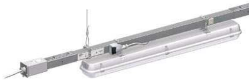
Canalis KBA with KBL