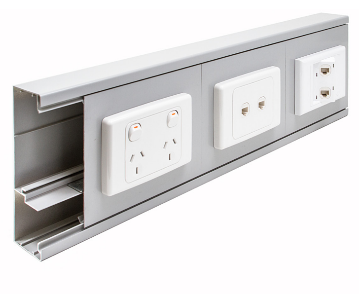
FULL SIZE SECTION