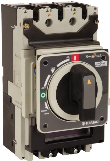
TB2 HB Direct Mounting IP54 Rated Black Handle 400/630 AF

Representative Photo Only (actual product may vary based on configuration selections)