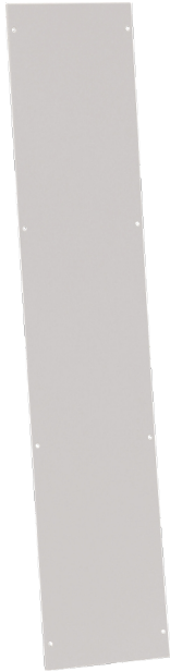
Side Panel 1.35mm Zinc Plated Steel H2000mmxD500mm (Qty 2)

Representative Photo Only (actual product may vary based on configuration selections)