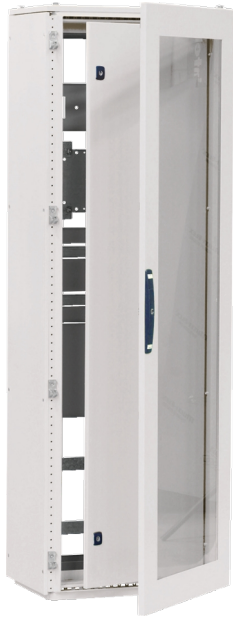
Inner Door Mild Steel Ral 7035 Suit H1800 X W800mm nVent HOFFMAN Floor Standing

Representative Photo Only (actual product may vary based on configuration selections)