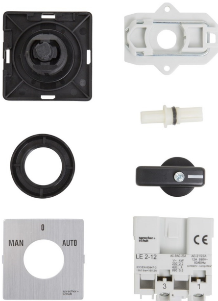
Representative Photo Only (actual product may vary based on configuration selections)