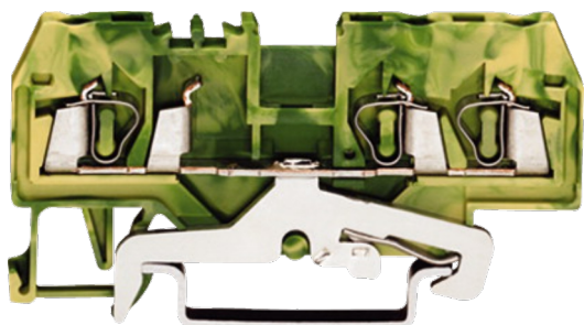
Representative Photo Only (actual product may vary based on configuration selections)