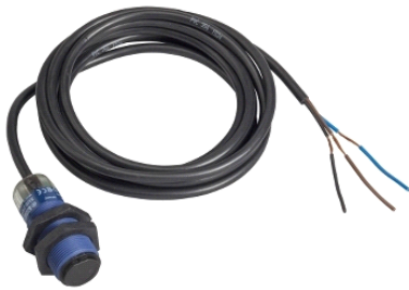
photo-electric sensor - XUB - receiver - Sn 15m - 12..24VDC - cable 2m