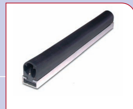
Safedge Pressure Sensitive Edge System

The MatGuard system comprises of 3 main components, the pressure sensitive mats, trim and a control unit. Pressure applied to one of the interconnecting mats will trip the system. Mats are available in a selection of sizes/shapes with trims and a selection of control units are available. Ideal for guarding floor space ensuring operators can not locate themselves near hazards.