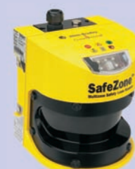
SafeZone Laser Scanner

EPDM: Ethylene Propylene Diene Modified Rubber NBR/CR: Acrylonitrile Butadiene Rubber/Chloroprene Rubber