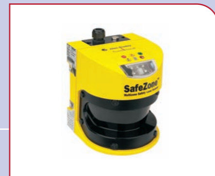
Safety Laser Scanner

Allen-Bradley Guardmaster Safety Light Curtains emit infra-red light beams for the detection of operators or objects and are used to guard hazardous movement ensuring operator and machine safety. A choice of units is available catering for finger/hand detection and part or whole body detection. They utilise single or multiple beams and offer a solution for most requirements.