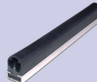
Safedge Pressure Sensitive Edge System