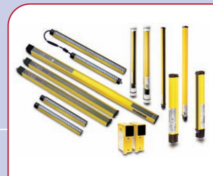
Safety Light Curtains

Allen-Bradley Guardmaster Safety Light Curtains emit infra-red light beams for the detection of operators or objects and are used to guard hazardous movement ensuring operator and machine safety. A choice of units is available catering for finger/hand detection and part or whole body detection. They utilise single or multiple beams and offer a solution for most requirements.