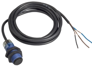
photo-electric sensor - XUB - emitter - 12..24VDC - cable 2m