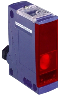
photo-electric sensor - XUX - emitter - 24..240VAC/DC - terminals