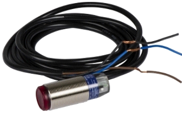
photo-electric sensor - XUB - emitter - 12..24VDC - cable 2m