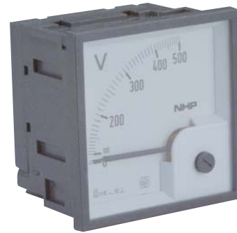
RQ72E VAC 500V