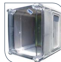
Polynova PM depth spacer