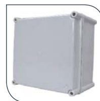
Polynova PC enclosure