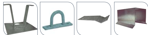
N13 N14 N15 N16