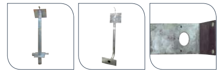
N03/3V N06/3V N08