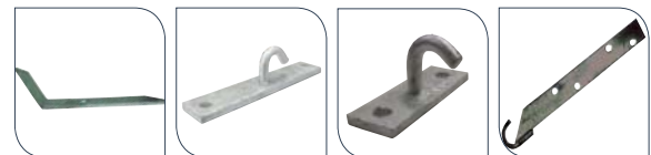
N12 N09 N10 N11