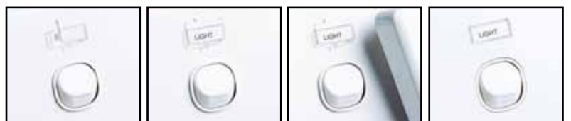
1. Attach window 2. Insert label 3. Fit cover 4. Finished product

The clear window simply clips into the grid and the label is inserted. A specially pierced cover is then clipped on to give you an easy to read label. These products are available fully assembled or as an ID Cover Kit comprising the relevant pierced cover, the necessary transparent windows, and some commonly used labels. Simply add 'I' to the standard catalogue number.